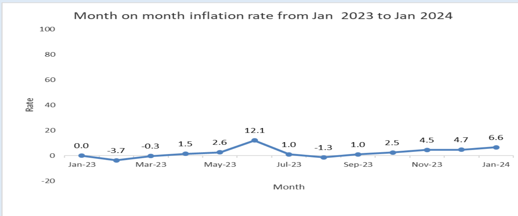
Figure 1: Month-on-month inflation rate from January 2023 to January 2024